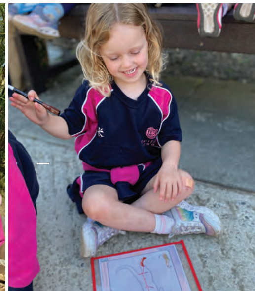
Drawing patterns on a meerkat.