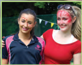
Sport 2025 Pages 6 - 7