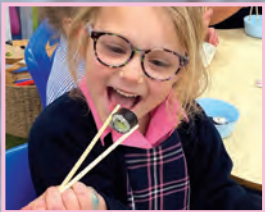
Bright Start Pages 2 - 3

Summer 2025 A busy term of learning and discovery!