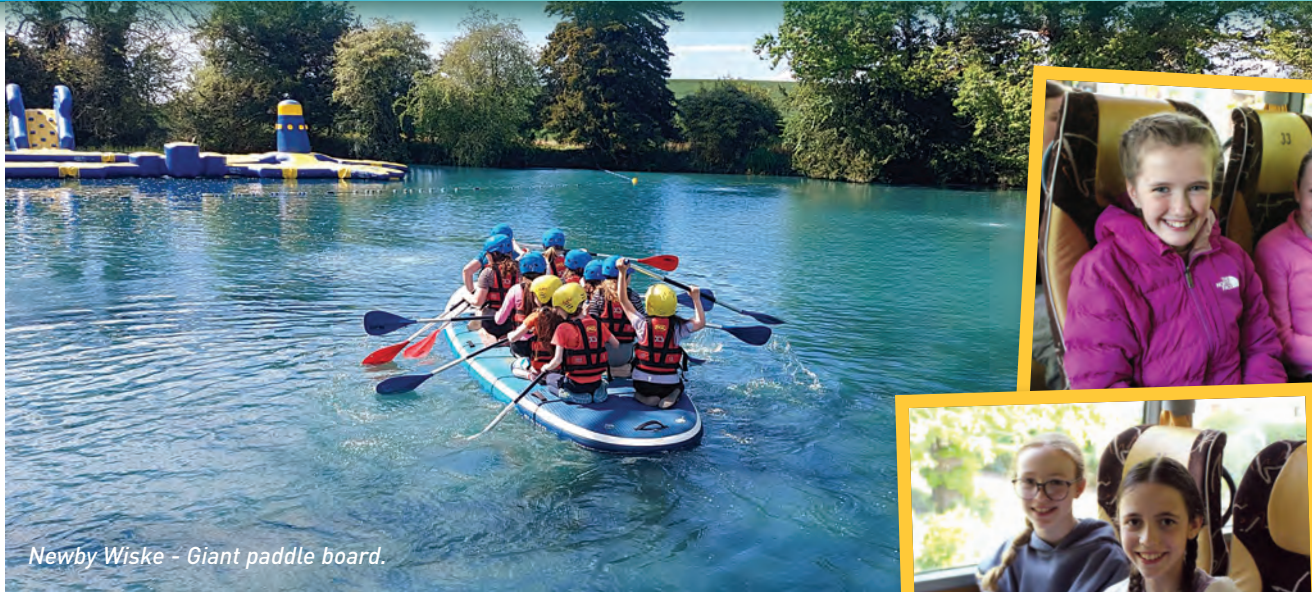
Newby Wiske - Giant paddle board.

This term we have had a range of out of school activities from making rainbow pallets at Gibside to going out of our comfort zone at Newby Wiske for a 3-day residential, where we experienced a number of somewhat testing activities from Jacob's ladder to problem solving but the overall favourite was the giant stand paddle board.