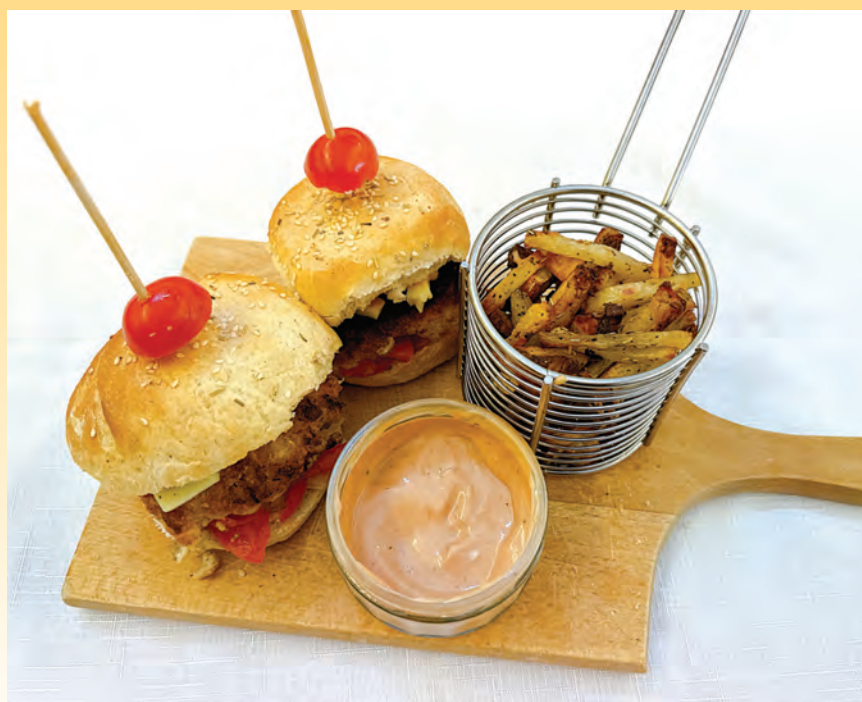
Chicken burger with home made fries.