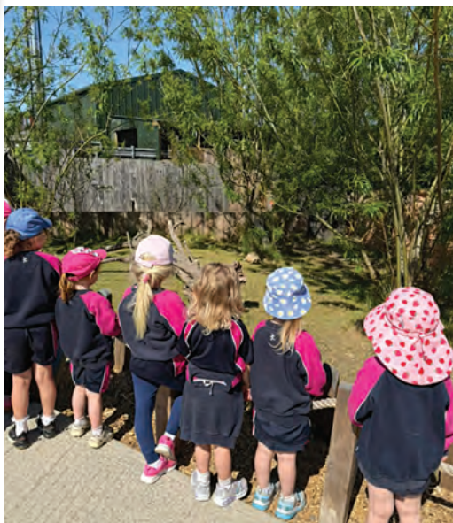
Watching the meerkats.

They are wonderful at remembering all of the actions to their songs and their singing voices are beautiful.