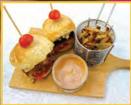
Tastebbox Challenge Page 11