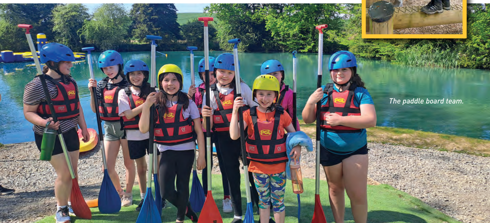
The paddle board team.