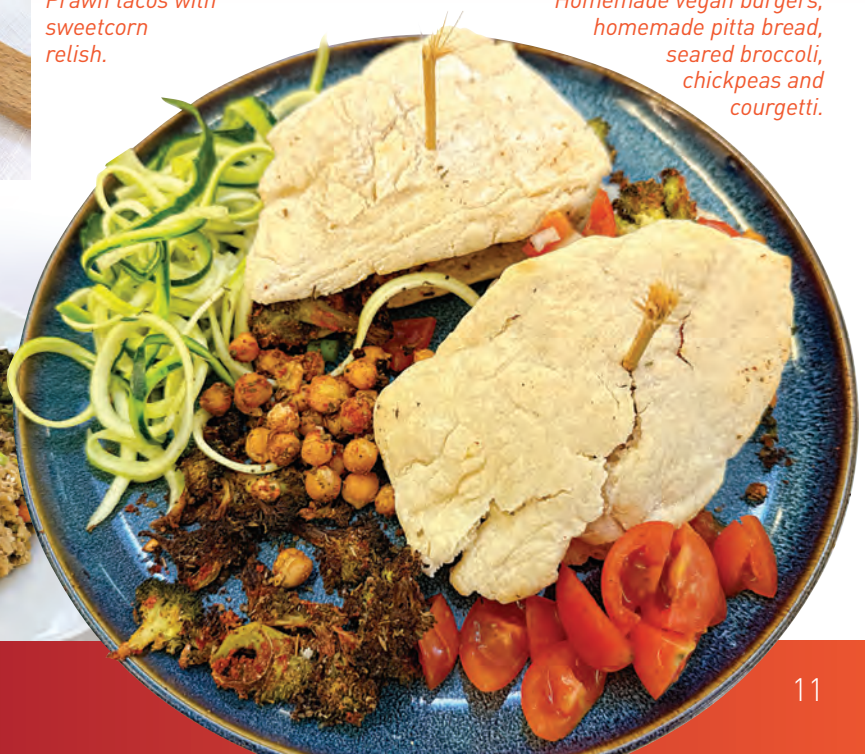
Homemade vegan burgers, homemade pitta bread, seared broccoli, chickpeas and courgetti.